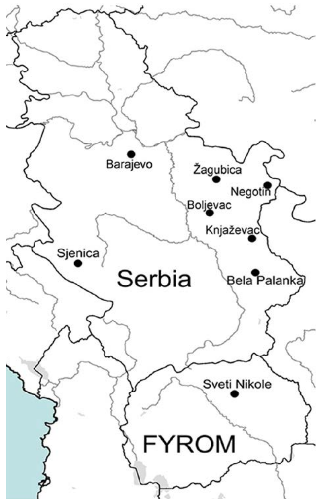
Figure 1. Map with localities in Serbia and Former Yugoslav Republic of Macedonia where wolves were hunted during 2009-2011.