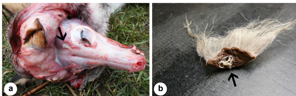
Fig. 2. Subcutaneously located Dirofilaria repens a) in a red fox ( Vulpes vulpes ) and b) in a wolf ( Canis lupus )

The cuticle of worms was thick and multilayered. On the external layer, there were regularly distributed longitudinal ridges. No such ridges were observed at either the anterior or the posterior side of the parasite. The muscle layer